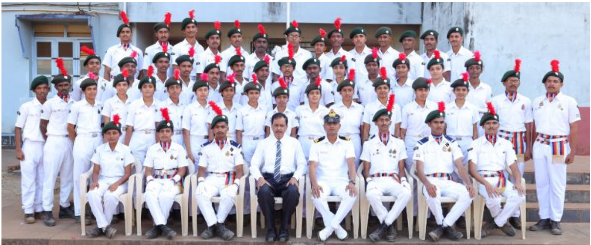
NCC NAVAL WING -2019-20