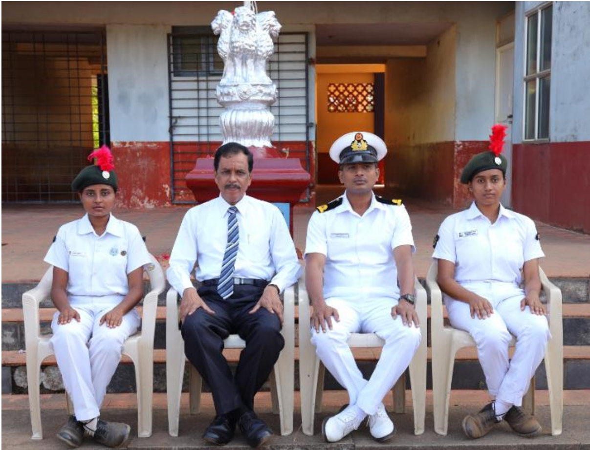
NIC CAPM AT EZIMALA IN KERALA