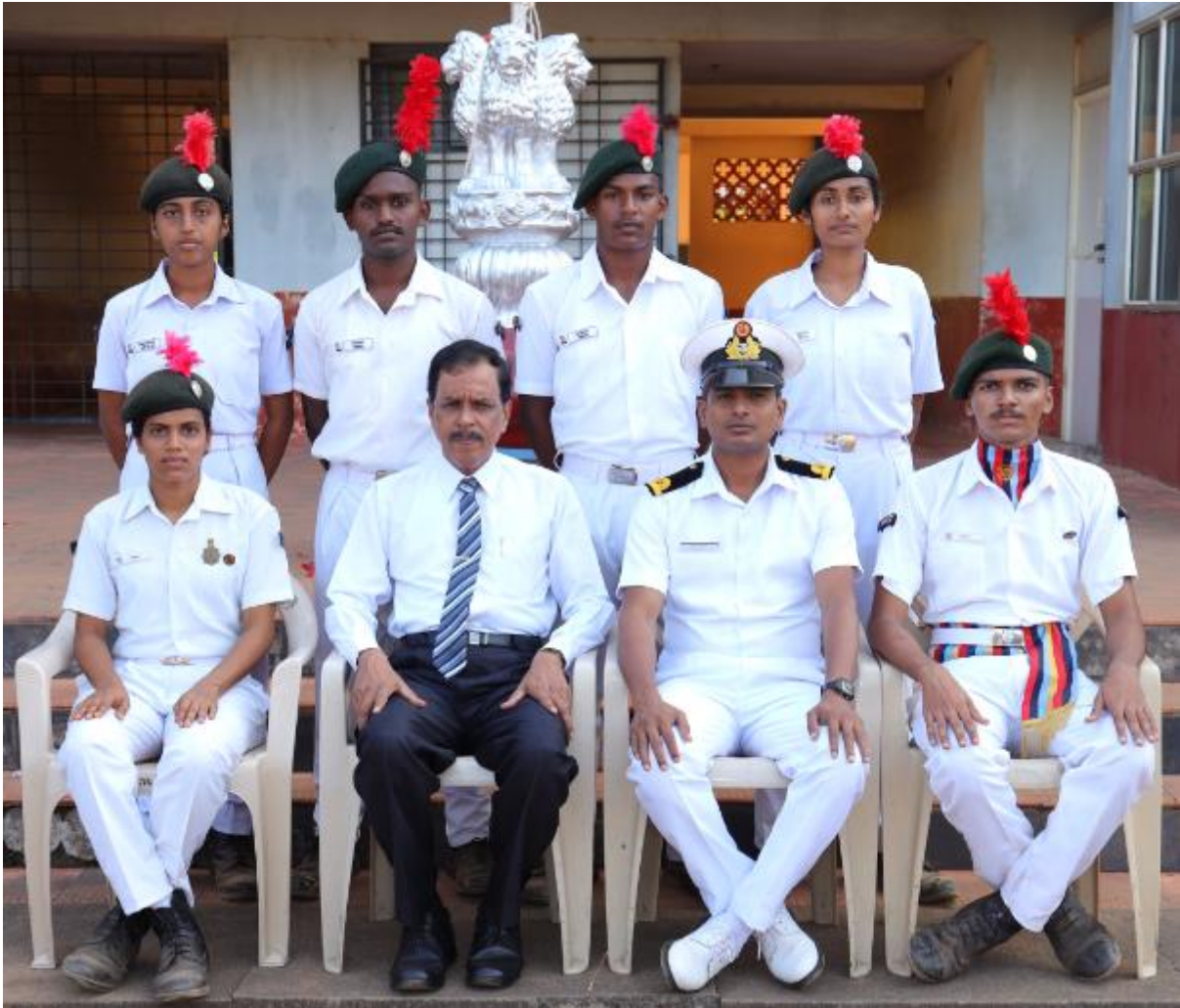
PRE NAV SAINIK CAMP AT ALVAS' COLEGE, IN MOODABIDRI