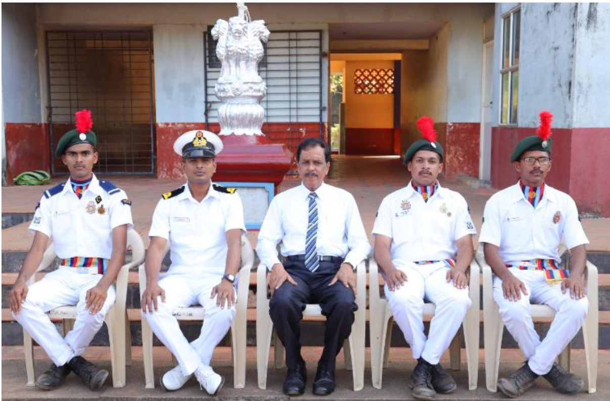
RDC PHASE - I