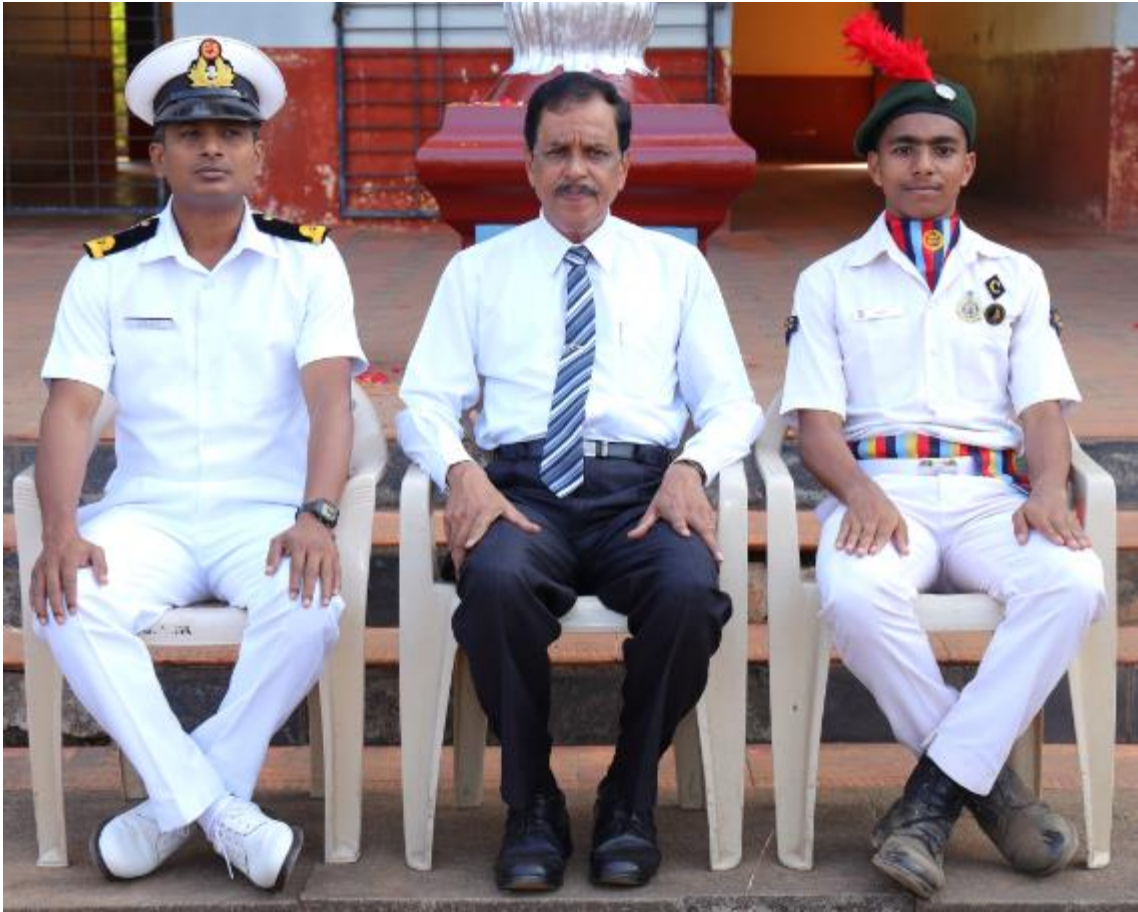
OCEAN SAILING CAMP IN GOA