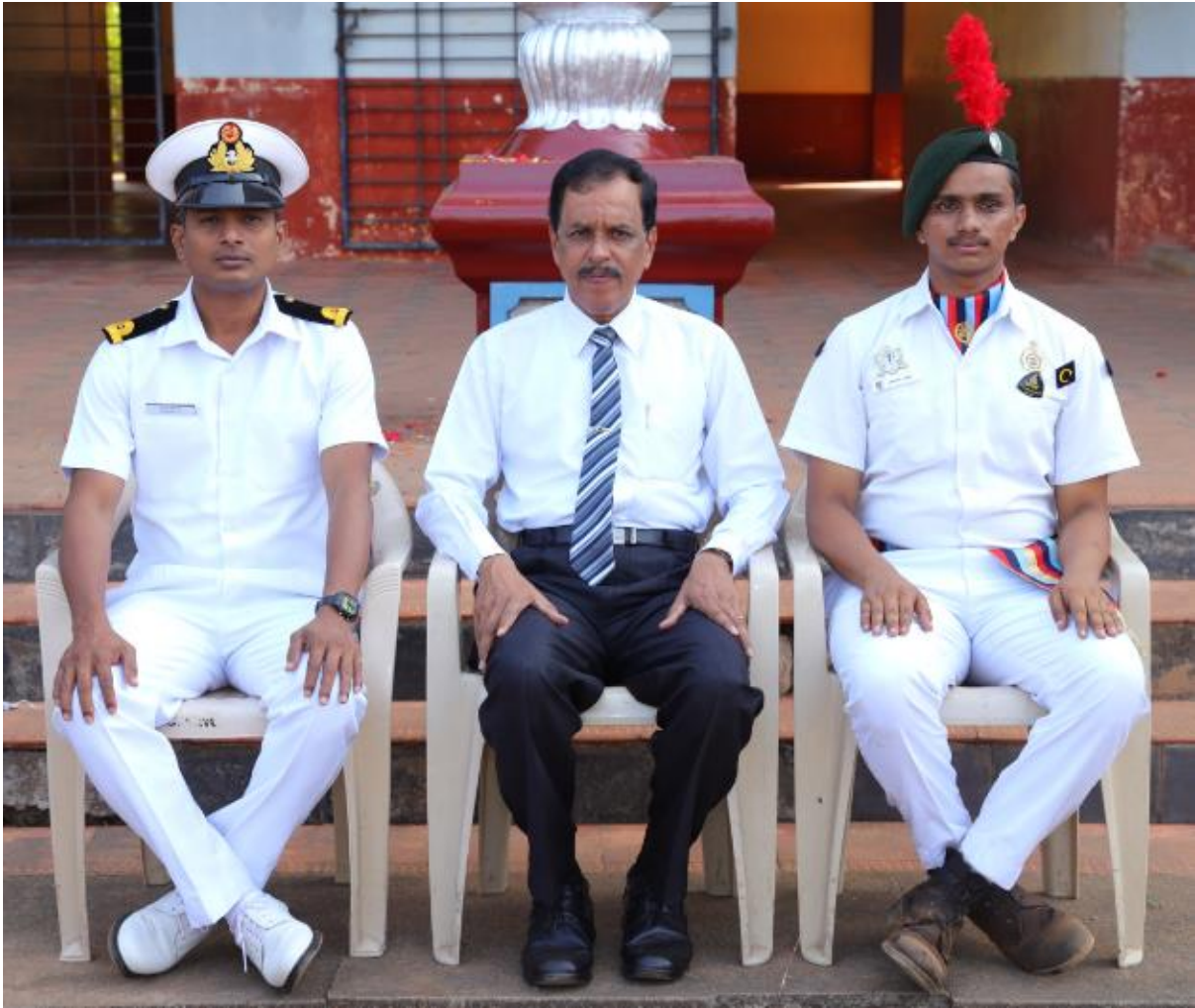
SAILING REGETTA CAMP IN MYSORE