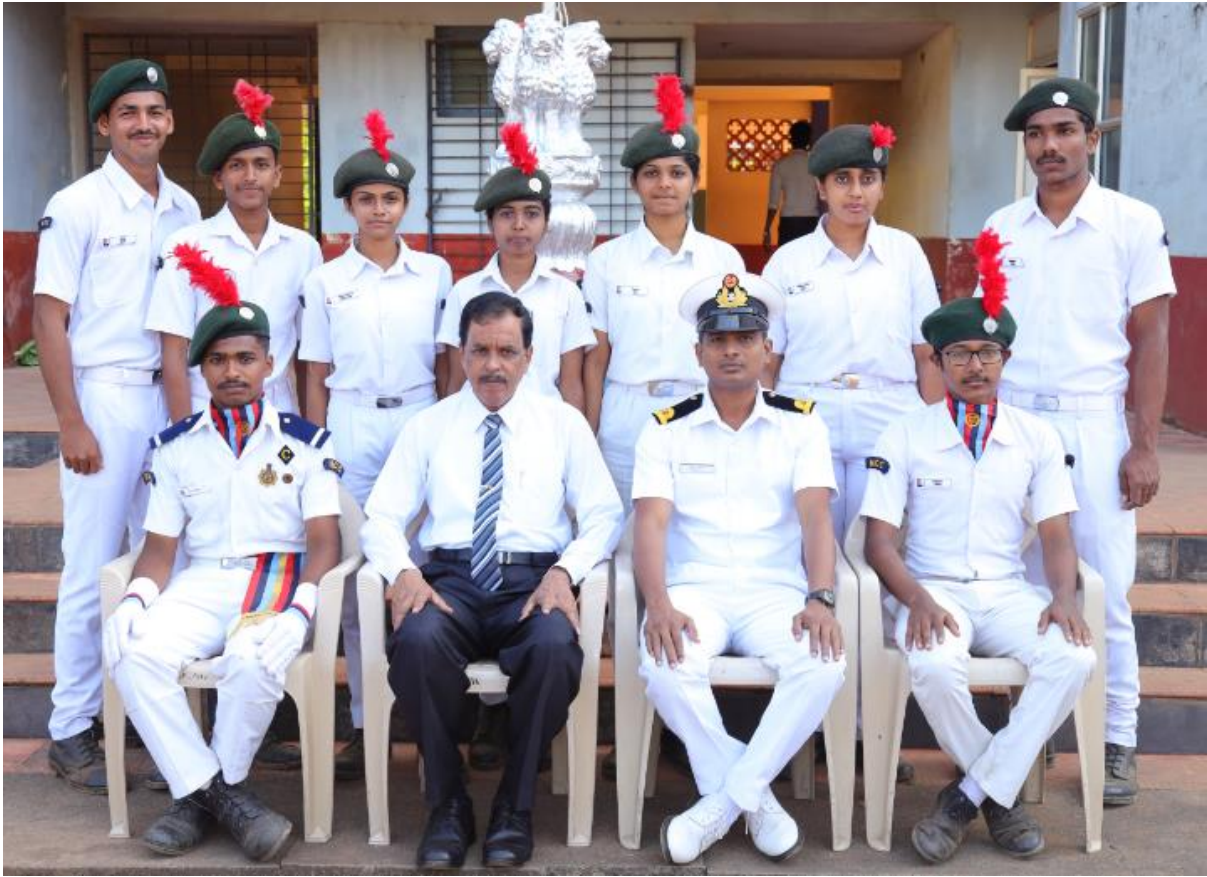
CATC CAMP AT CHARA, IN HEBRI